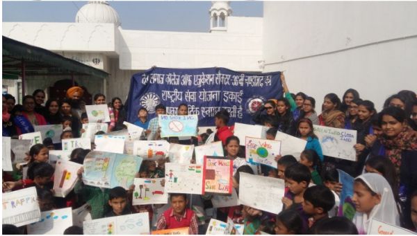
RALLY FOR FREE MEDICAL CHECKUP AT VILLAGE BUTERLA