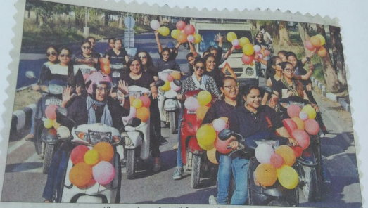
चंडीगढ़ क्लब से रुरु हुई स्ट्रटर रैली में भाग लेती प्रतिभागिनी।