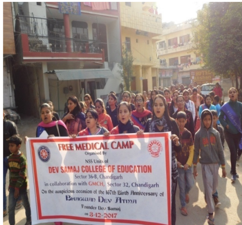
TRAFFIC POLICE: STRATEGIES FOR SELF SAFETY